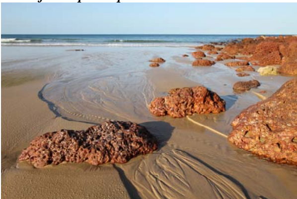
Magnificent beach scene near Gove