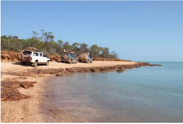
We were invited to this idyllic location