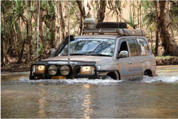
Water crossing on the way to Gove