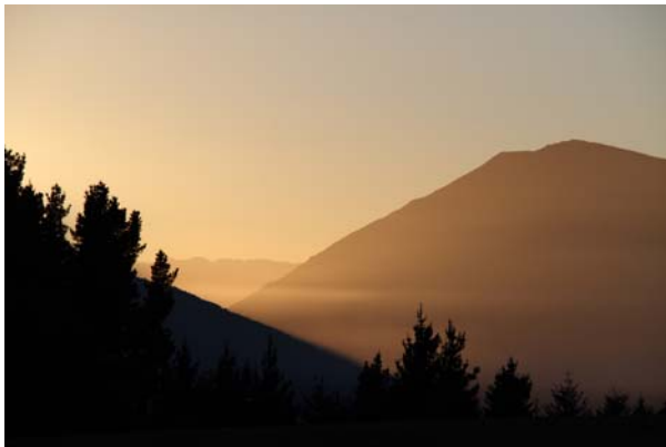
A New Zealand sunrise