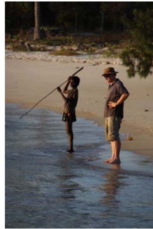
Lessons in spear throwing

The stand out feature had to be sitting around a camp fire with an aboriginal family singing traditional songs and having their “pet” crocodile come out of the ocean just 8 metres away. It sat on the waters edge, all 4 metres of it and watched us for 2 hours, we watched it too! A truly amazing experience! Then we visited another community which is just starting to understand the importance of tourism, I think we may have been their first visitors, the camp here was rated by our friends, the travelling Catteralls (they are following my around Australia notes on a 6 month family holiday) as the BEST they had experienced to date!