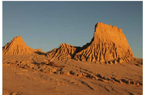
The Walls of China at Mungo