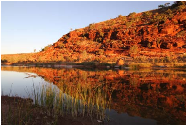
The scene from or camp at Boggy Hole Arnhem Land

old Policeman's Waterhole we all had a swim and enjoyed the evening and early morning chorus provided by the abundant bird life. This trip concluded at Tennant Creek, it truly was a fantastic experience.