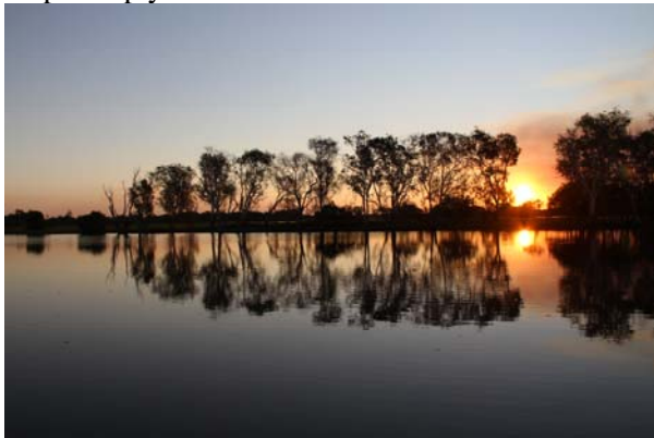
Yellow Waters Cruise

I know many of you are keen to know how I went with my reccie trip to Arnhem Land. I have at least 25 interested parties for a trip up there next August. I have to say I had a magical 2 weeks exploring Arnhem Land. First we covered Katherine Gorge and all the major highlights of Kakadu NP including Twin and Jim Jim Falls, a swim in Gunlom Falls and a sunset cruise on Yellow Waters. We also squeezed in sunset on Ubirr Rock, another croc spotting sunset cruise near the Adelaide River as well as the jumping crocs, I then explored Litchfield and all of its wonderful waterfalls and even tackled the infamous Reynolds River 4WD track in fading light. Let me assure you, driving through crocodile infested rivers that were near waist deep in half light certainly helps keep you awake!