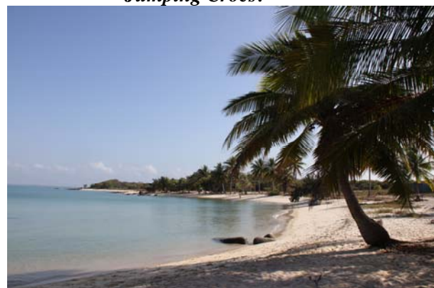
Our camp with our indigenous hosts, absolutely heaven.