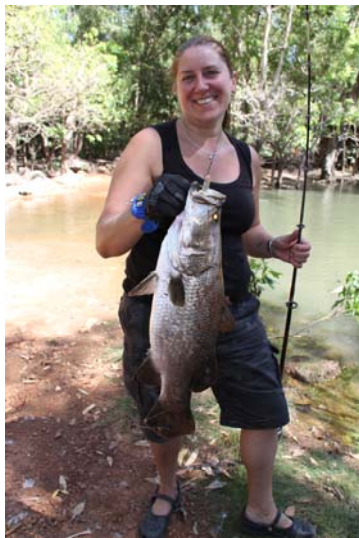
Yep we caught Barramundi

Needless to say we had an absolutely awe inspiring time in Arnhem Land, I’m now working with various communities and local indigenous councils to provide the most outstanding Arnhem Land experience. Once all the details are finalised I’ll contact everyone on the wait list with all the details. I believe I will be running at least two trips up there next year to cater for the demand. If you are interested in getting more details on this trip drop me an email and I’ll forward them once it is finalised. Things do move slowly in Arnhem Land so it may be another 3 months before I have it all locked away.