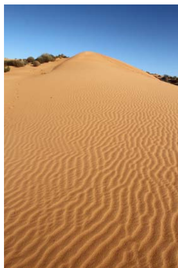
Dunes north of Lake Gairdner