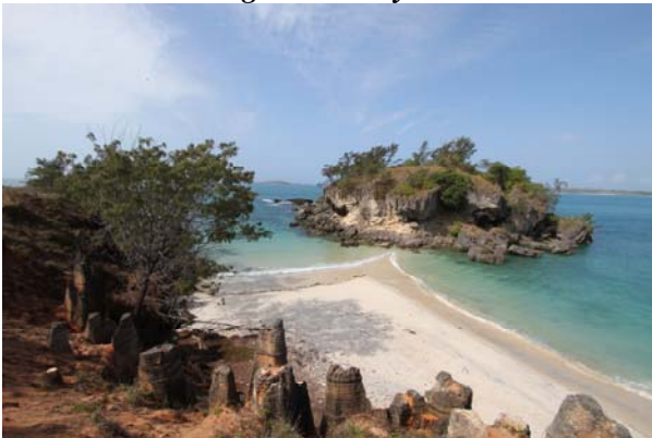
One of our special places in Arnhem Land